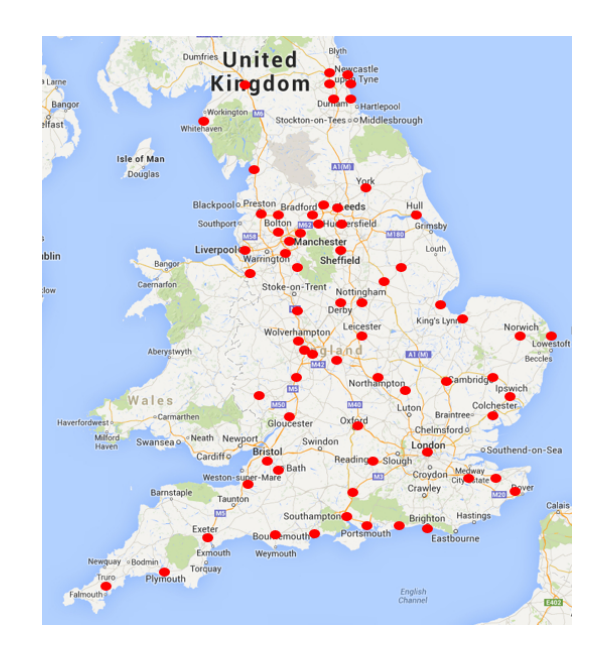
Figure 2: Locations included in the English data

the cities for which occupation data were reported in the 1861 Census of Population, with the exception of London, a substantial outlier, and a few cities for which we had difficulty constructing the full set of explanatory variables. Figure 2 provides a map of the cities included in our analysis database.